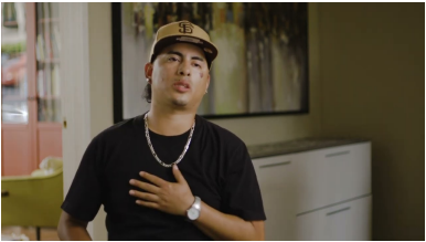
Victim of Violence & Traumatic Brain Injury (TBI)