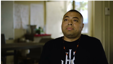
Inmigración y Salud Mental