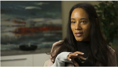
Mental Health & PTSD